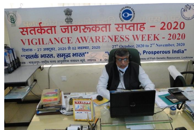
Online different aspects vigilance awareness programme sensitization conducted by vigilance officer