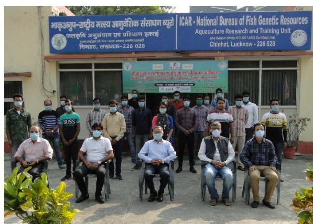
Skill India Training Assessment Participants, assessors and faculty vigilance awareness sensitization on dated 27/10/2020